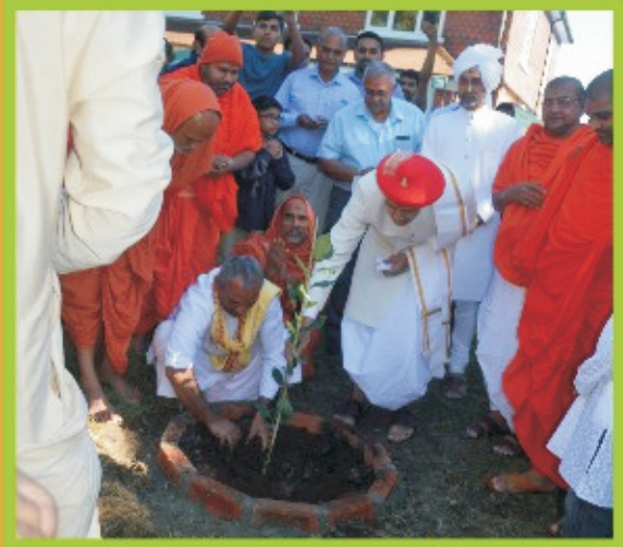
In view of 'Preservation Plus' Project in our Museum for protection of Environment in our Museum and with the noble aim of our H.H. Shri Mota Maharaj, tree plantation in Croli temple (U.K.) by our H.H. Shri Acharya Maharaj.

Registered under RNI - No - GUJENG/2007/20198 "Permitted to post at Ahd PSO on 11 the every month under postal Regd. No. GUJ. 582/15-17 issued SSP Ahd Valid up to 31-12-2017