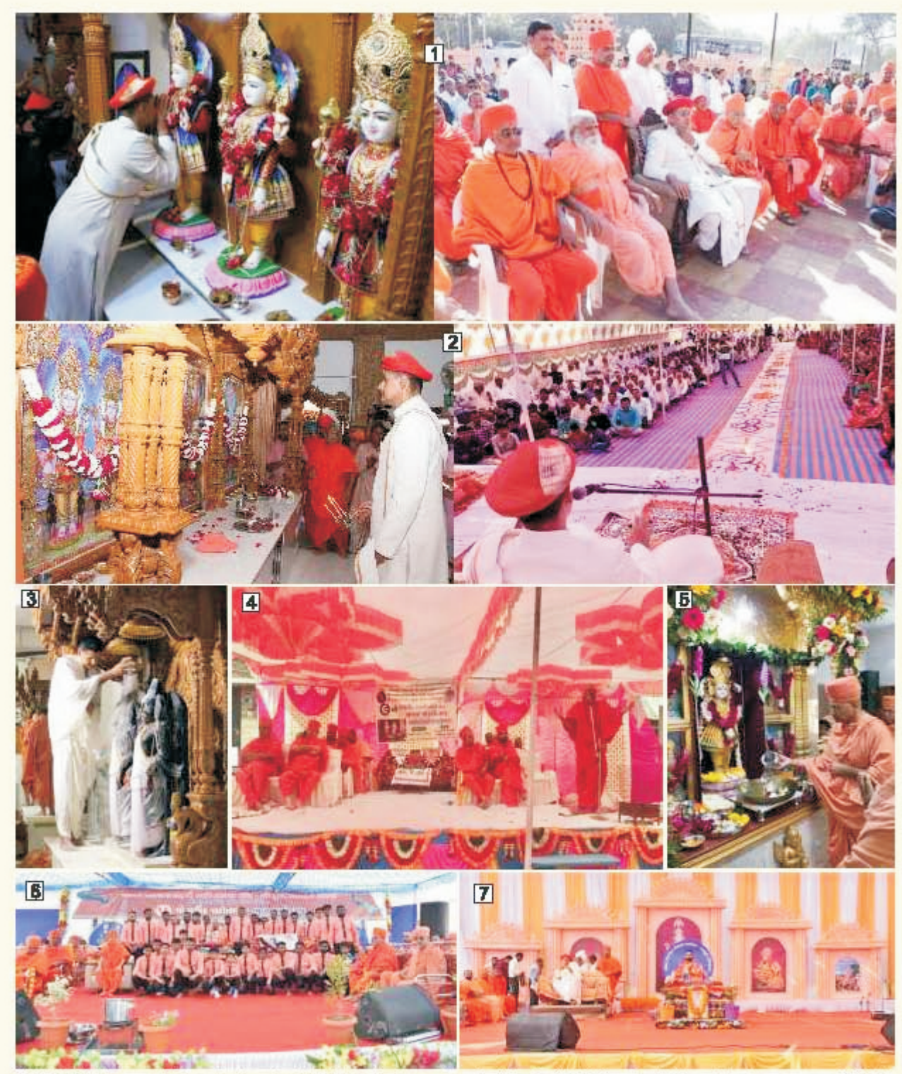
(1) H.H. Shri Acharya Maharaj performing Murti Pratiatha in new temple of Porda (Kathial) and watching cultural programme. (2) H.H. Shri Acharya Maharaj performing Murti Pratiatha in Zundal new temple and Haribhaktas availing the benefit of divine Darahan. (3) H.H. Shri Acharya Maharaj performing Abhahak of Thakadi on the occasion of Patotaav of Braupura temple. (4) H.H. Shri Acharya Maharaj performing Abhahak of Thakadi on the occasion of Patotaav of Arijali temple. (5) Salaha of Sainta and Haribhaktas on the occasion of Patotaav of Patotaav of Patotaav of Patotaav of Patotaav of Baraja temple. (7) Mahant Bwami of Ahmedabad temple and saint Mandal of Gandhinagar on the occasion of Patotaav of Brimpuna temple and Shakotaav. (6) H.H. Shri Acharya Maharaj granting Darahan in the Sabha on the occasion of Katha in Dhanpura Vijapur temple.