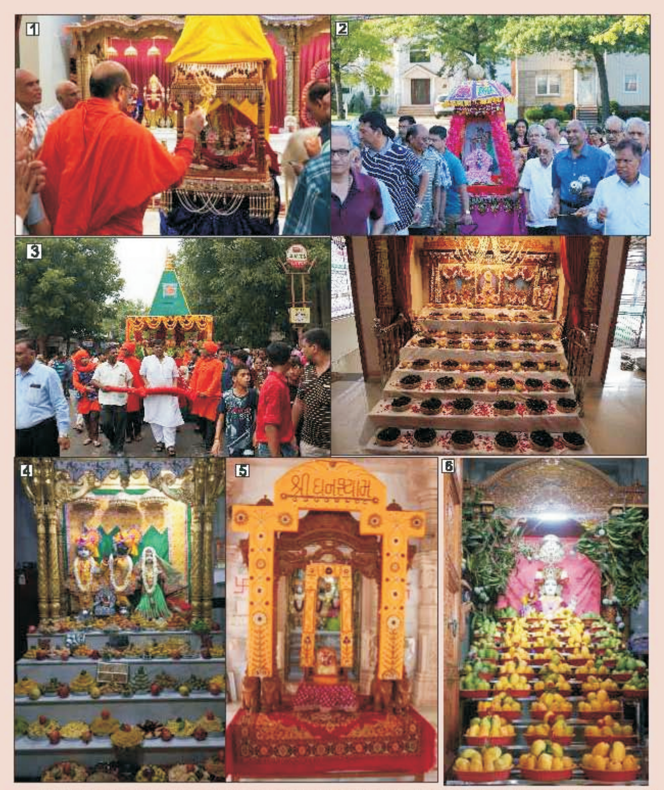
(1) Rathyatra Darshan in Parsippany (America) temple. (2) Rathyatra Darshan organized by our temple on the roads of New York. (3) Rathyatra and Jambu Utsav Darshan organized by our New Ranip temple. (4) Annakut Darshan in front of Thakorji on the occasion of Patotsav of Ayodhya temple. (5) Artistic Hindola Darshan in front of Thakorji in Mehsana emple. (6) Amrotsav Darshan in Gandhinagar Sector-2 temple.